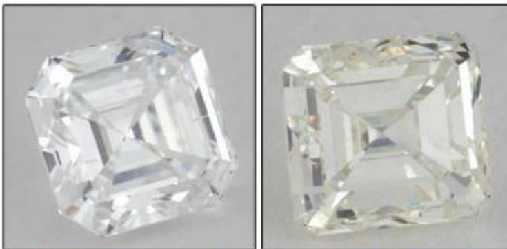
Asscher Cut - Color: D

Because a colorless diamond, like a clear window, allows more light to pass through it than a colored diamond, colorless diamonds emit more sparkle and fire. The formation process of a diamond ensures that only a few, rare diamonds are truly colorless. Thus the whiter a diamond's color, the greater its value.